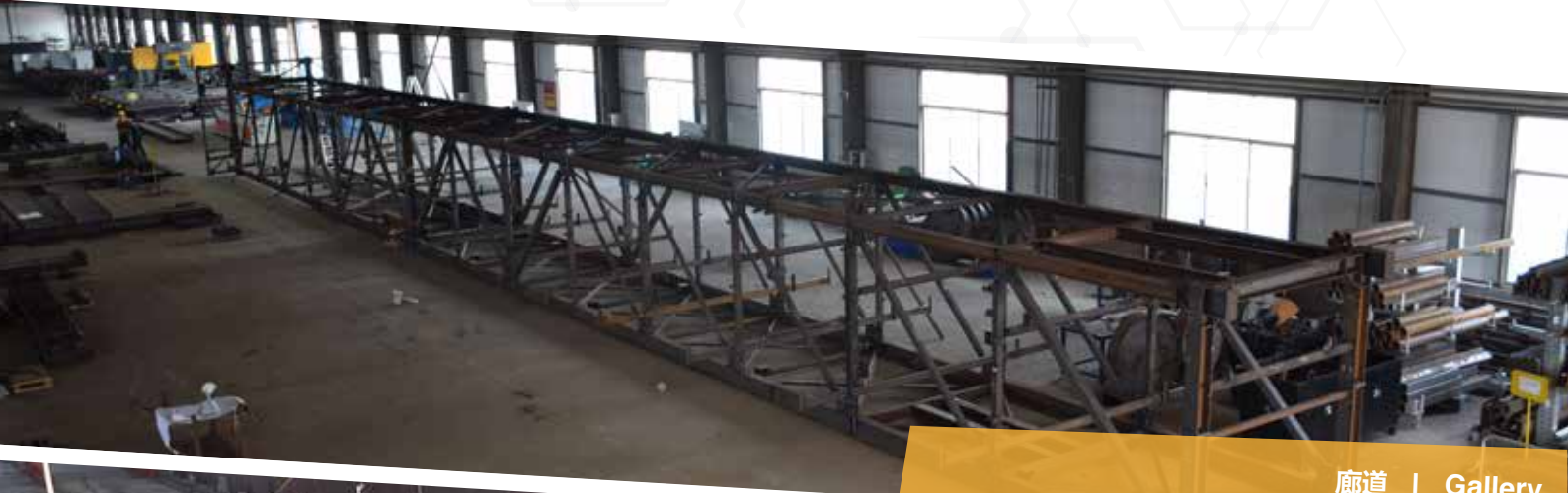
廊道 | Gallery