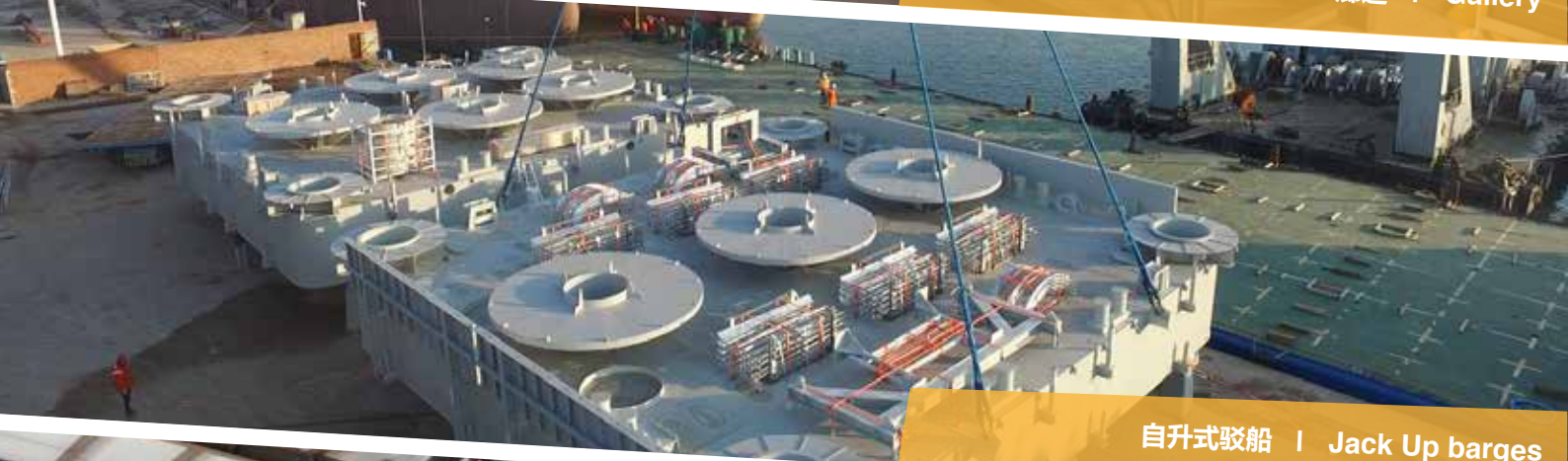
自升式驳船 | Jack Up barges