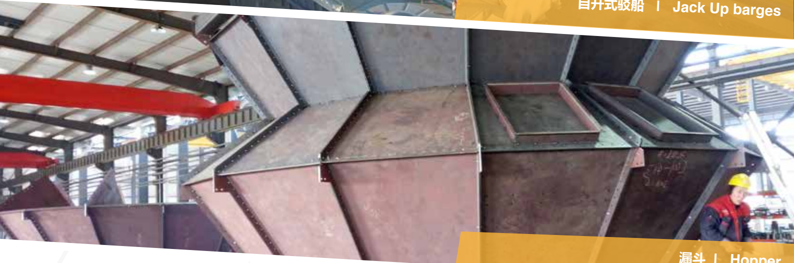
漏斗 | Hopper